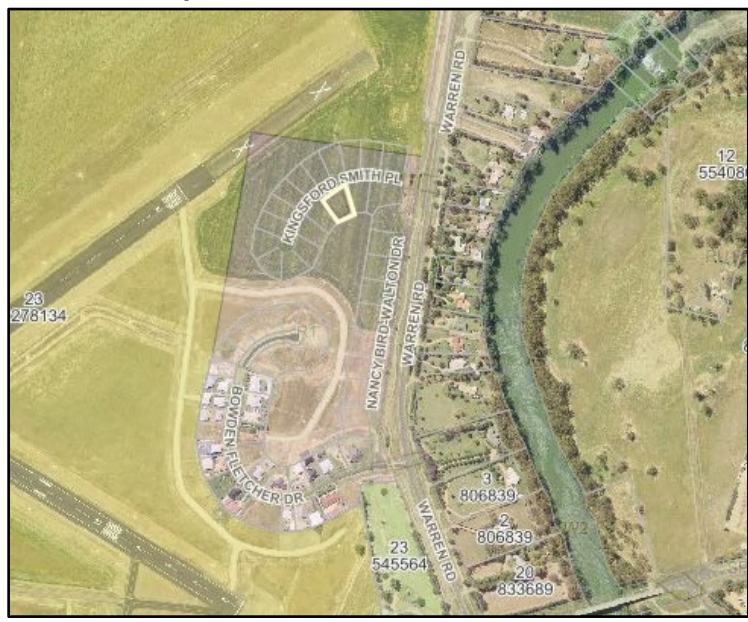
7 Kingsford Smith Place NARROMINE- Lot: 55 DP: 1271467